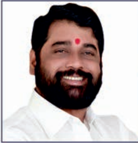
Hon. Shri. Eknath Shinde Chief Minister, Maharashtra State