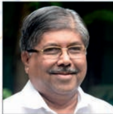
Hon. Shri. Chandrakant Patil Minister, Higher & Technical Education, Government of Maharashtra