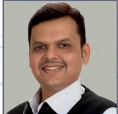
Hon. Shri. Devendra Fadnavis Dy. Chief Minister, Maharashtra State